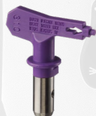
Fine Finish Tip