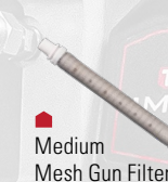
Medium Mesh Gun Filter