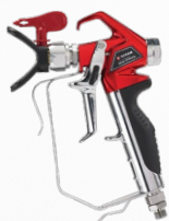
RX-Pro 2-finger Gun with Tip