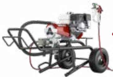
■ Elite 3500 Low Rider