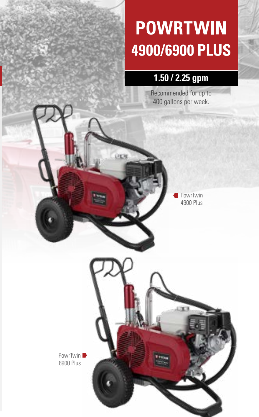
▀ PowrTwin 4900 Plus