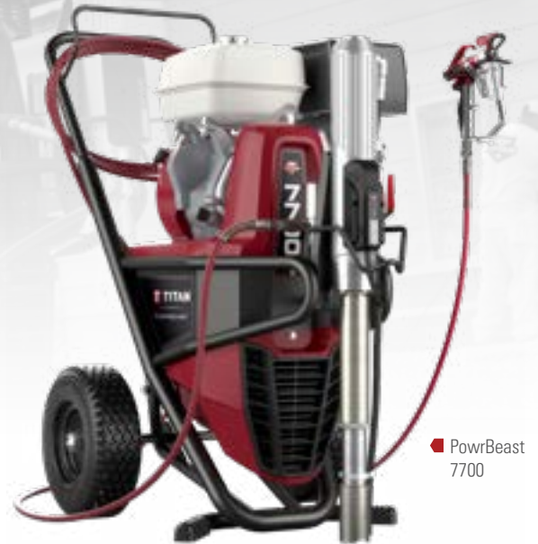
■ PowrBeast 7700