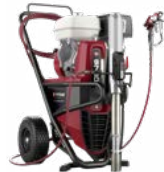
■ PowrBeast 9700