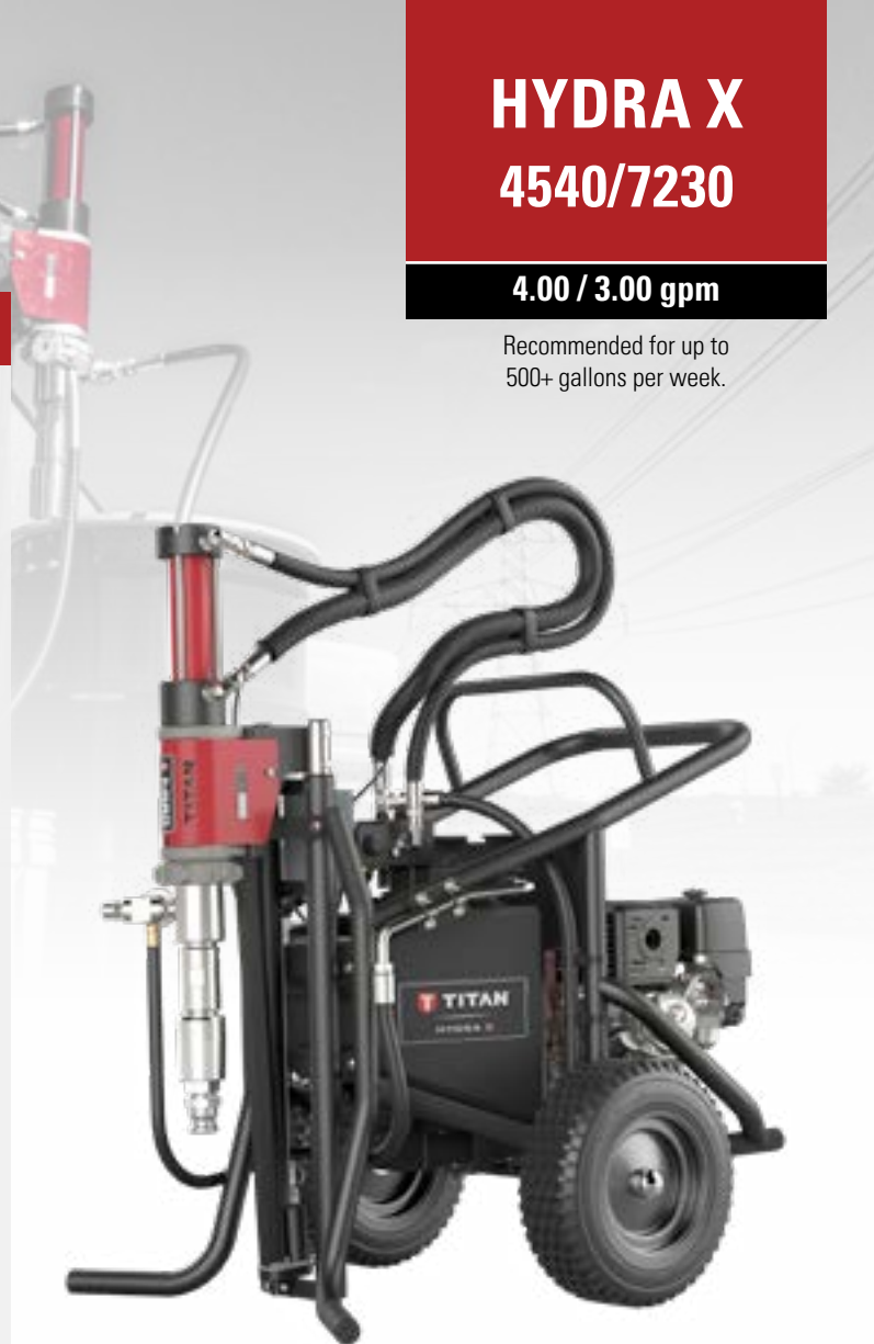
■ Hydra X 7230