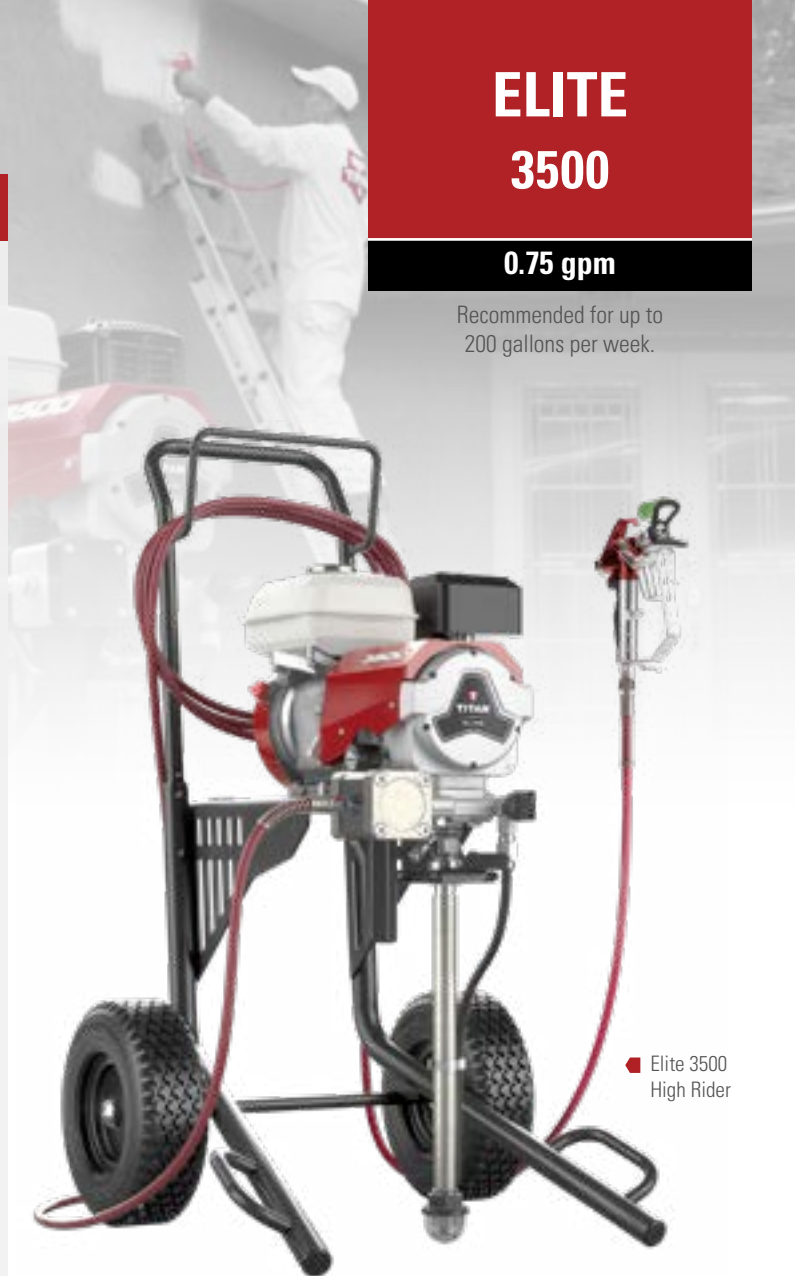
■ Elite 3500 High Rider