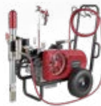
■ PowrTwin 6900 Plus DI Electric

Configured with a submersible foot valve designed for very heavy materials, including drywall mud.