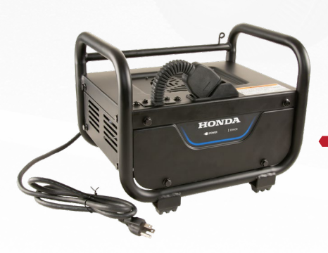
Honda Lithum-ion Battery Charger (US-Plug)