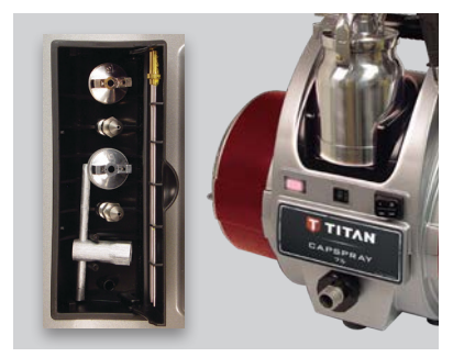
Onboard Tools Convenient built-in cup holder, tool box for air caps and projector sets

High-performance automotive type air filter delivers clean atomizing air and a consistent fan pattern.