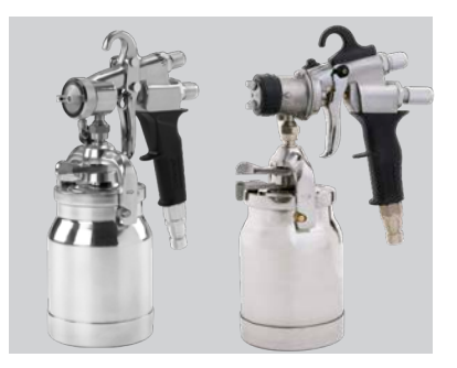
Best-in-Class HVLP Guns Deliver the ultimate finish and maximum control.

High-end woodworking, cabinetry, and furniture projects require a finish that only a Capspray HVLP system can deliver. The Capspray Series is efficient and durable with unmatched portability and intelligent design making jobsite life easier.