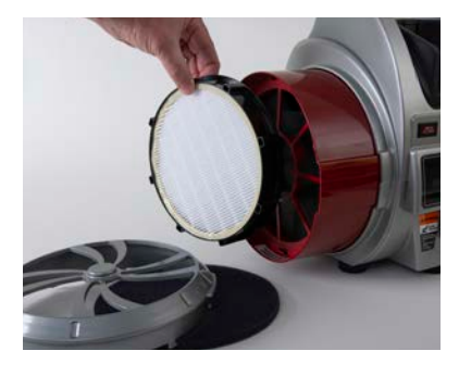
Quick Change Dual Air Filtration No tools required to change filters for atomizing and cooling air filters.