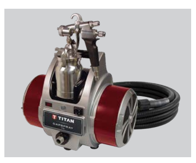
Choose From 3- to 6-stage Power Spray light- to heavy-bodied coatings without thinning.