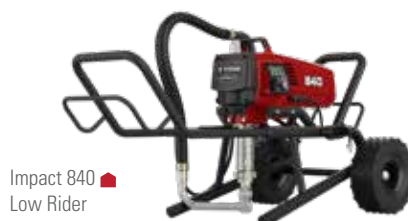
Impact 840 Low Rider