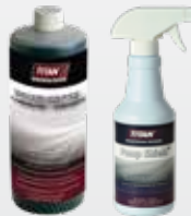
Pump Shield™ 297055