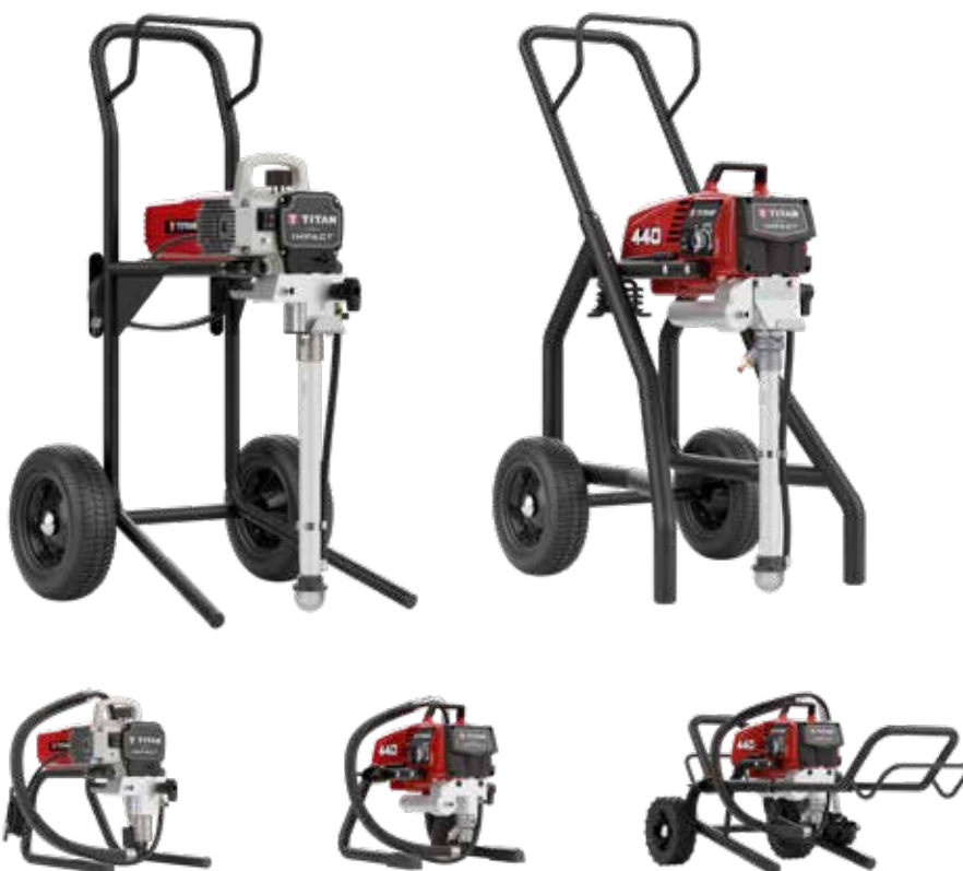
■ Impact 410 Skid

The Impact 440 sets the standard for the rental industry with ease of use, straightforward maintenance and the power to spray tough coatings. The Impact 440 is designed to spray 50-75 gallons per week and is built to apply coatings for residential, municipal, property maintenance and small commercial applications.