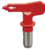
■ SC-6+ Reversible Tip