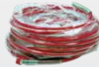
Hose Shield 521424