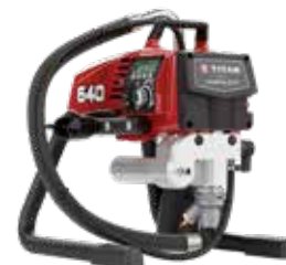
Impact 640 Skid