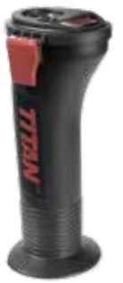
■ Pump Runner