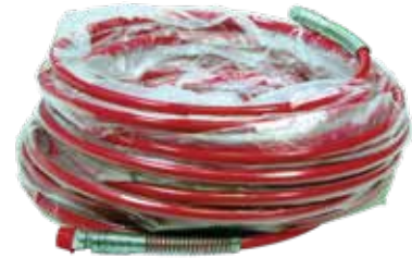
■ Hose Wrap (hose not included)