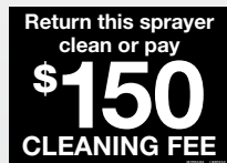
Cleaning Fee Stickers LB40354