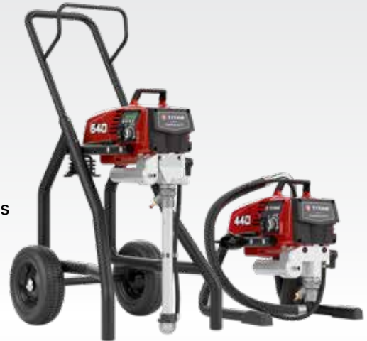
Impact® 640 HR