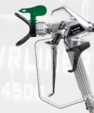
RX-80 4-finger Gun with HEA Tip