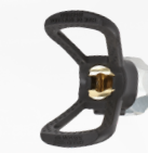
No Build Tip Guard