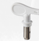
TR™ Line Stripping Tip