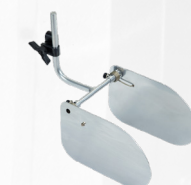
WindGuard Spray Shield