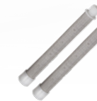
White 60 Mesh Filters (2-pack)