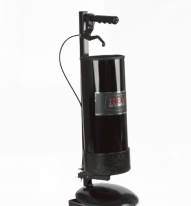
HandiBead Bead Dispenser

*Included with each PowrLiner 3500, 3500S, and 5500. LS-10 Liquid Shield is provided in a 4 ounce trial bottle.