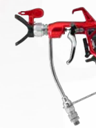
RX-Apex Gun with TR¹ Tip