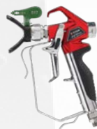
RX-Pro 2-finger Gun with HEA Tip