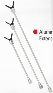
Aluminum Gun Extensions