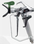
RX-80 4-finger Gun with HEA Tip