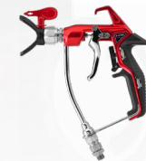
RX-Apex Gun with TR 1 Tip