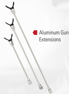
Aluminum Gun Extensions