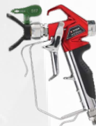
RX-Pro 2-finger Gun with HEA Tip