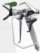
RX-80 4-finger Gun with HEA Tip