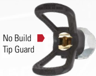
No Build Tip Guard