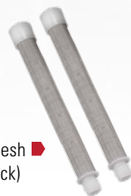
White 60 Mesh Filters (2-pack)