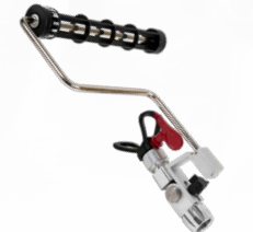
SprayRoller Head with TR¹ Tip