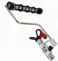
SprayRoller Head with TR 1 Tip

* Included with each Elite 5500. LS-10 Liquid Shield is provided in a 4 ounce trial bottle.