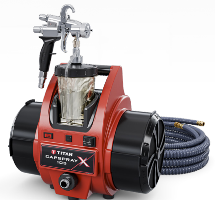
Capspray X 105 w/ Maxum II Gun and CapLiner System