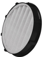
■ Replacement Air Filter