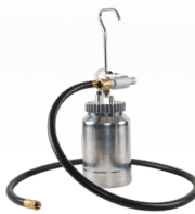
■ 2-Qt. Remote Cup System