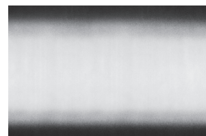
Latex paint through a HEA 517 tip at 1,000 PSI