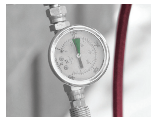
HEA Pressure Gauge Part No. 0580495

MAXIMIZE THE PERFORMANCE OF YOUR HEA TIP